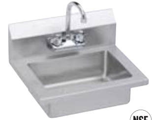
EHS-18-TSX No mounting hardware included